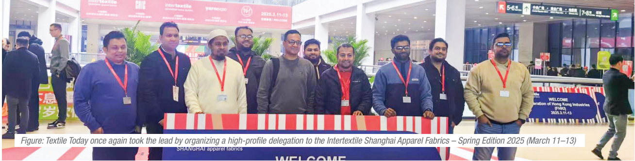
Figure: Textile Today once again took the lead by organizing a high-profile delegation to the Intertextile Shanghai Apparel Fabrics – Spring Edition 2025 (March 11–13)