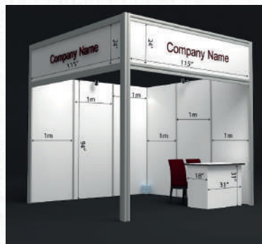
Two Face Open Booth