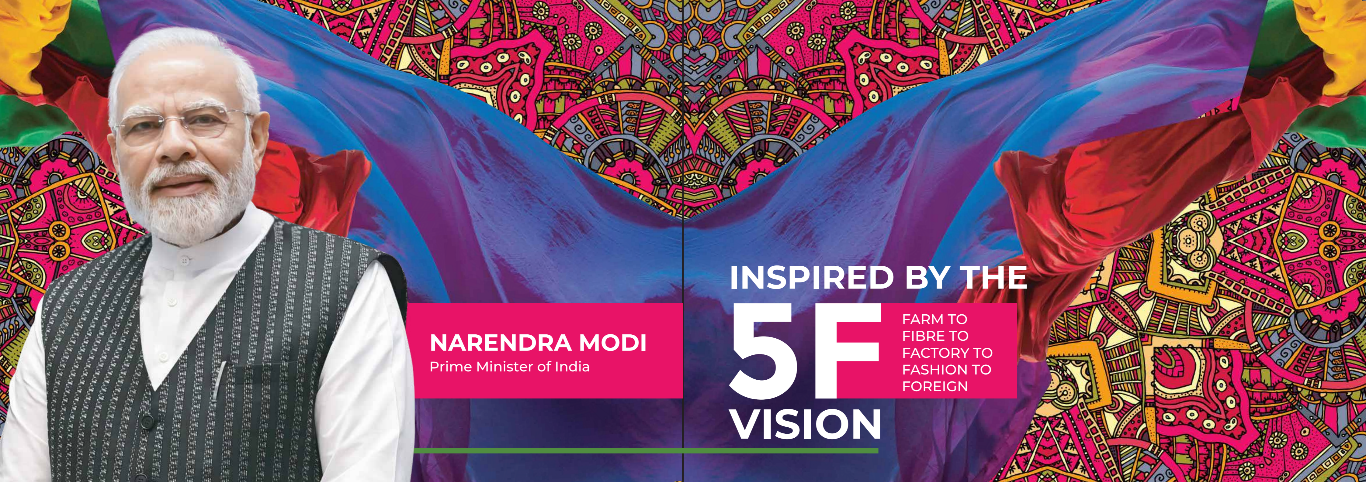
NARENDRA MODI Prime Minister of India